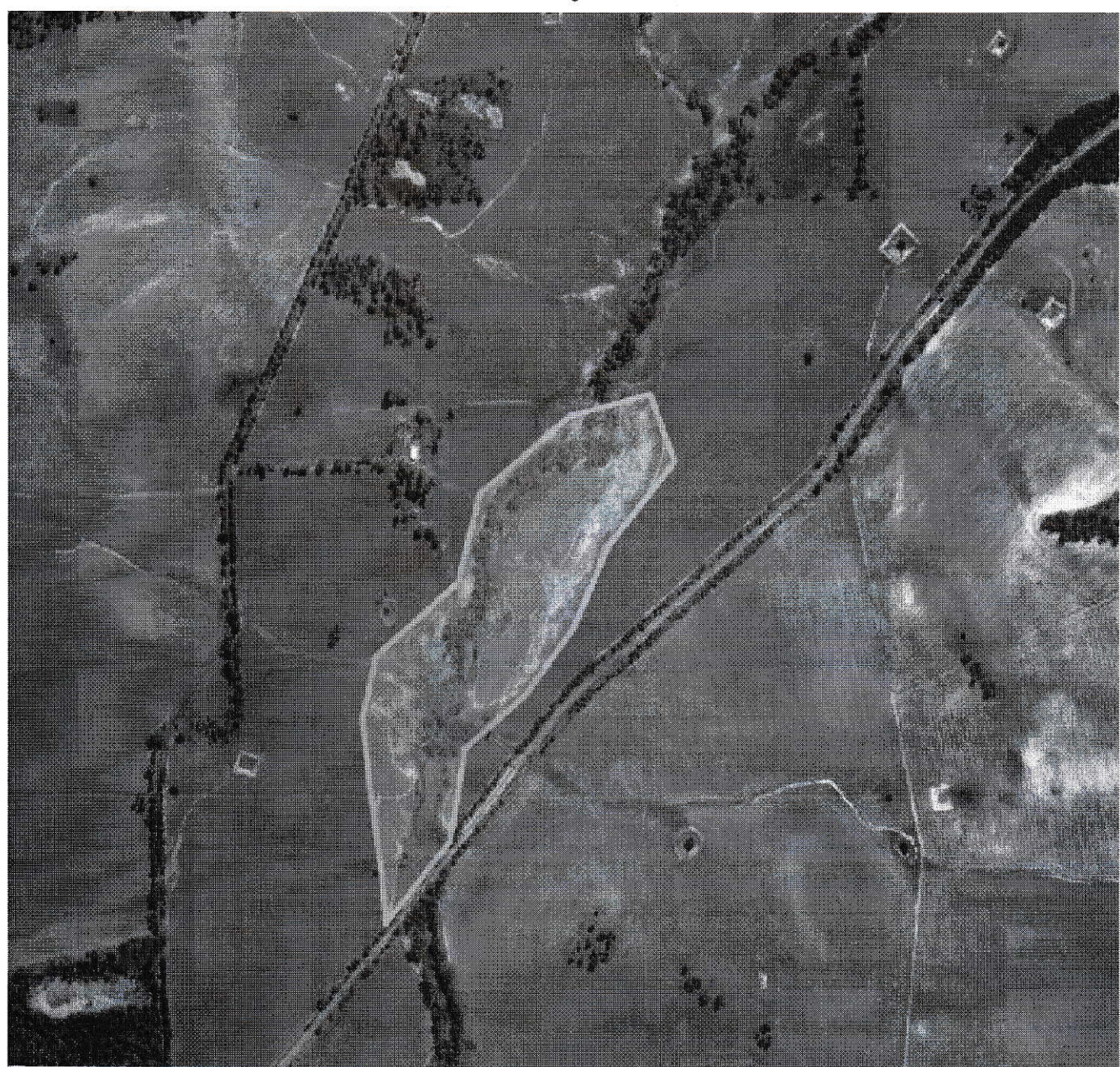
Fence 2.2km Area 20ha.