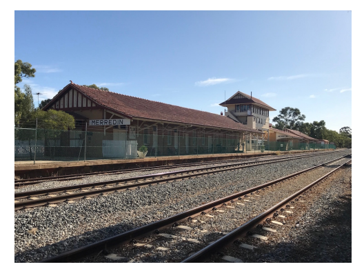
Merredin - owned by Shire of Merredin, the Historical Society run the railway museum.