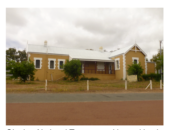
Gingin - National Trust owned leased by the Shire of Gingin. Café established in 2020.

Wyalkatchem - owned by Shire of Wyalkatchem. Some rooms are rented by a vet and another business, but the station is mostly vacant. It is on the opposite side of the railway lines from the goods shed and the 1933 grain storage that is an Agricultural Museum. There is no connection between the railway station and the museum in the main street.