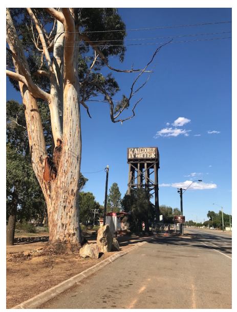
Water tower and tank in Merredin