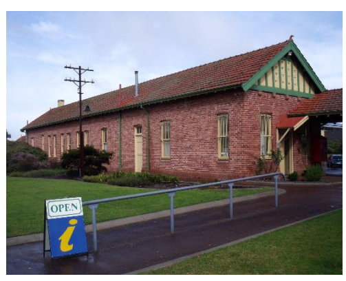
Mount Barker - owned by Shire of Plantagenent. Visitors Centre.