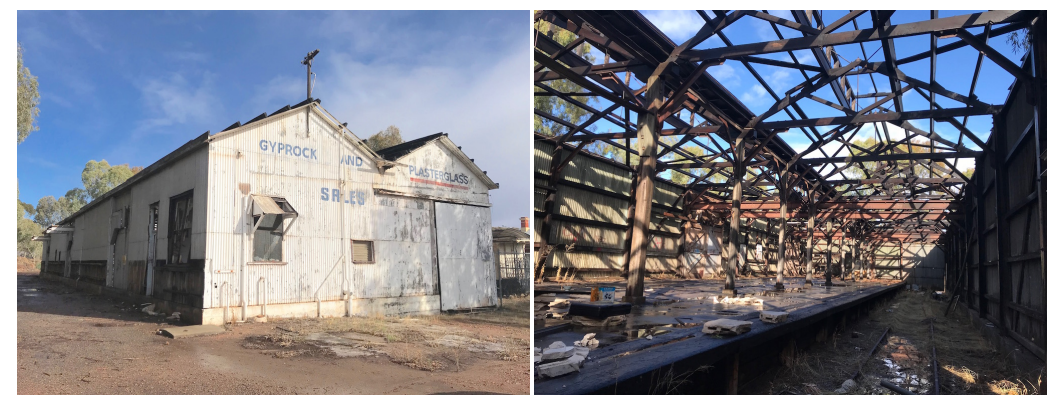
Northam goods shed – partially demolished with removal of asbestos roof.