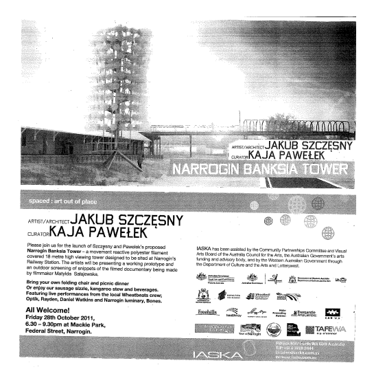
Proposed Banksia Tower